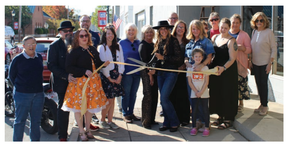
HEDY & CO. ARTISAN MARKET

Congratulations to new businesses Hedy & Co. and Sowing Seeds Primary Care on their grand openings. Hedy & Co is an artisan market in Downtown Germantown where one can purchase unique, handcrafted goods. Sowing Seeds Primary Care is a new primary care medical office off of Route 4.