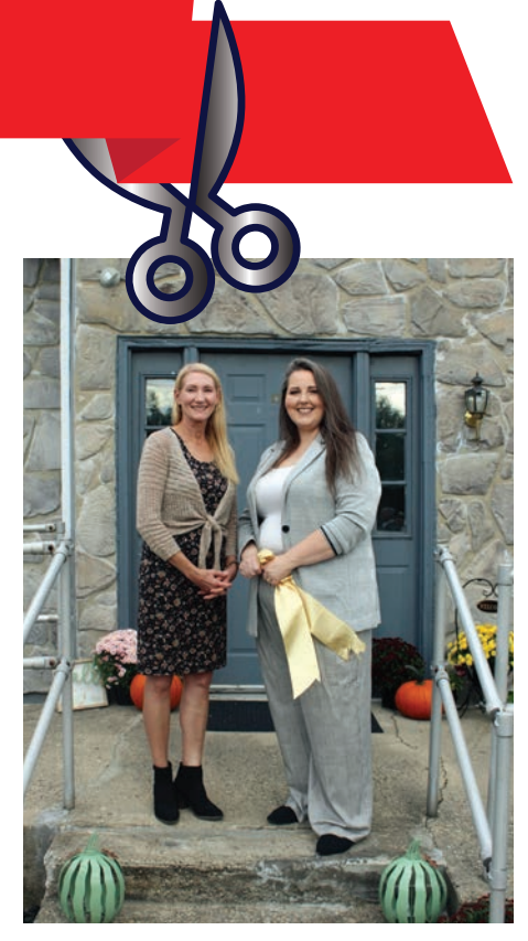
SOWING SEEDS PRIMARY CARE

Congratulations to new businesses Hedy & Co. and Sowing Seeds Primary Care on their grand openings. Hedy & Co is an artisan market in Downtown Germantown where one can purchase unique, handcrafted goods. Sowing Seeds Primary Care is a new primary care medical office off of Route 4.